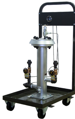
Side Stream Filtration System